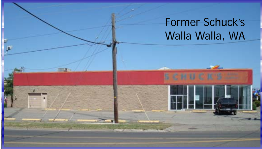
Former Schuck's Walla Walla, WA

253-853-2840 (office) 253-973-2324 (cell)