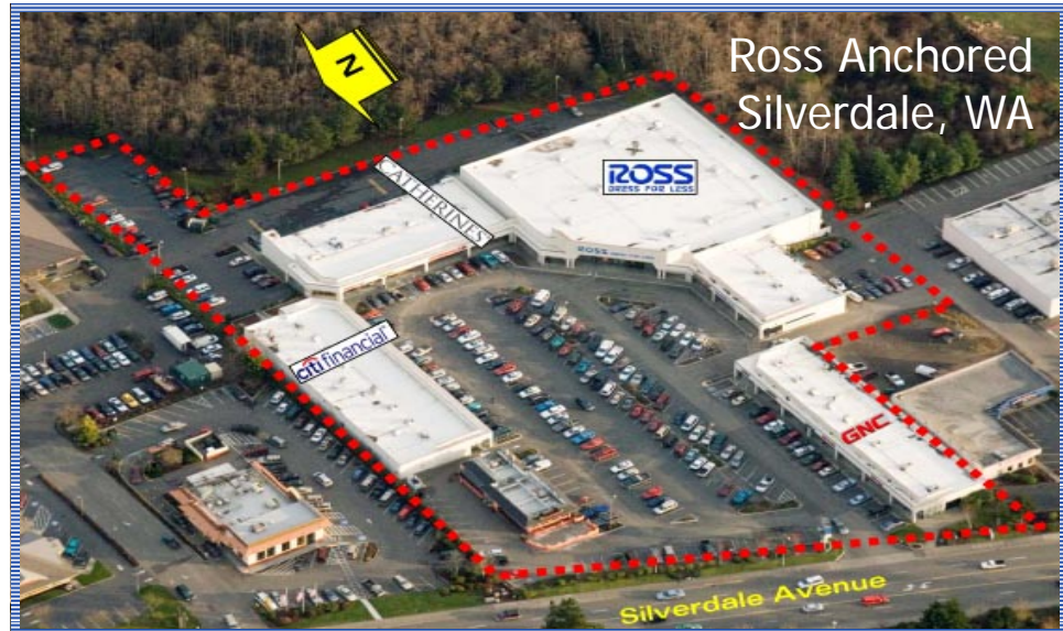
Ross Anchored Silverdale, WA

253-853-2840 (office) 253-973-2324 (cell)