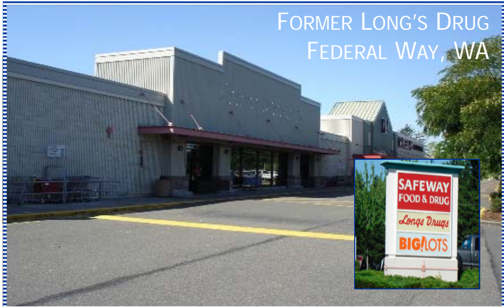
FORMER LONG'S DRUG FEDERAL WAY, WA

253-853-2840 (office) 253-973-2324 (cell)