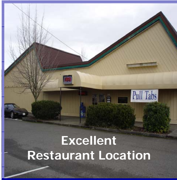
Excellent Restaurant Location